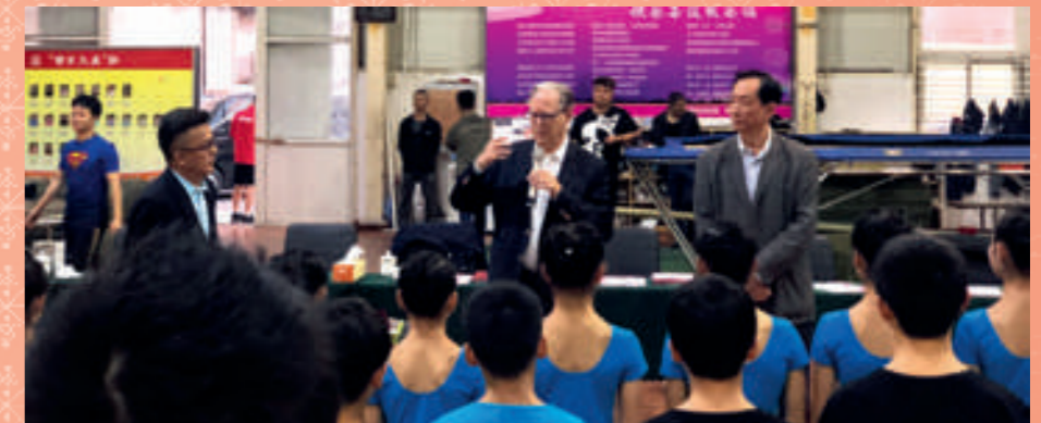
The China Acrobats Association celebrated WCD in Beijing, Zhuhai City in Guangdong province and Luoyang City in Henan province. http://www.21caa.org