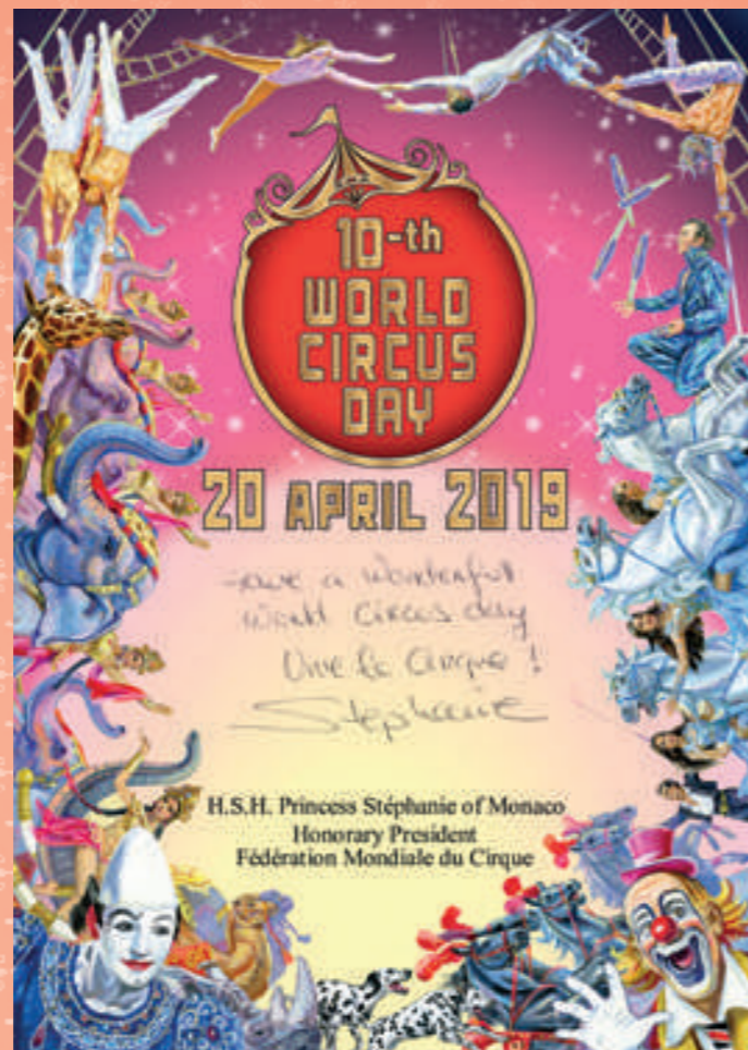
Greeting card from H.S.H. Princess Stéphanie of Monaco, Honorary FMC President.

Acting massively together is a way to show the world that we are united and we work together to safeguard our values and traditions for the sake of the next generations.