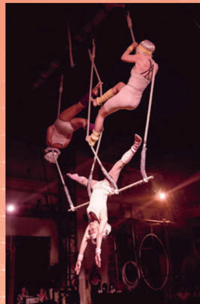
Vulcana - The "Insert Audience Here Cabaret" presented a diverse program of new short circus works. Brisbane Powerhouse, Brisbane circus@vulcana.org.au