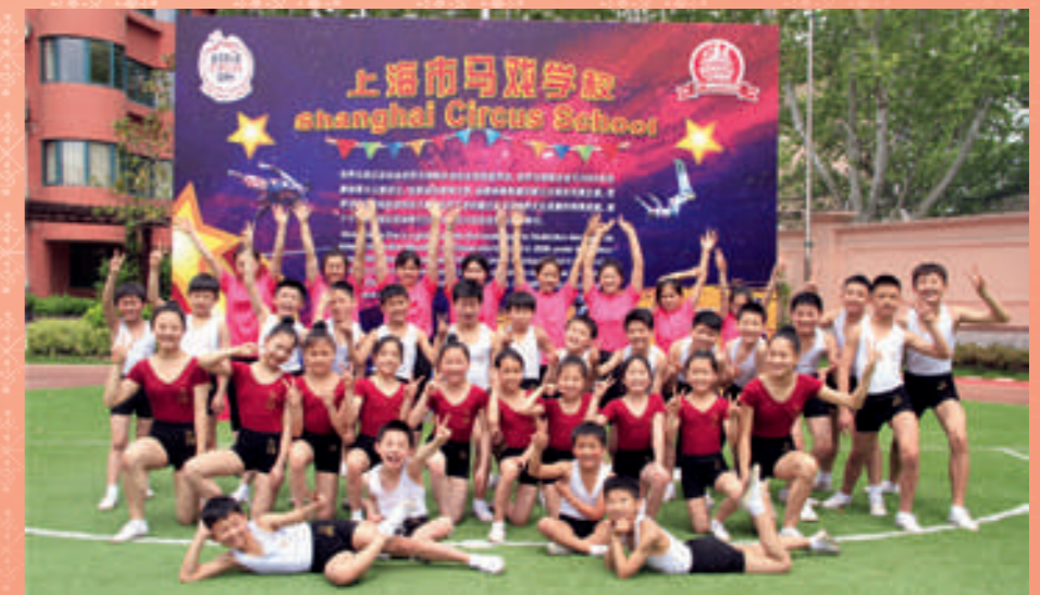
The acrobatic students of the Shanghai circus school, celebrating and having fun on WCD. http://www.sh-cs.com