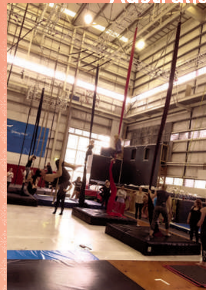
National Institute of Circus Arts Australia - To celebrate WCD keen adults were invited to fun one-hour introductory sessions to give them a little taste of what circus is all about. Why should kids have all the fun? NICA, Melbourne http://www.nica.com.au